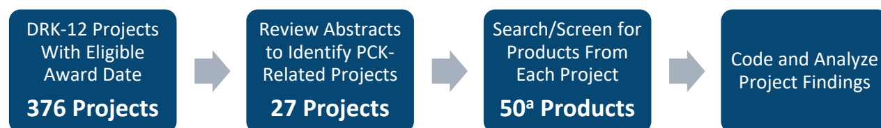
Figure 3. Overview of Our Synthesis of 27 DRK-12 Projects Related to PCK

a More than 50 products were identified, but for feasibility, we restricted our synthesis to the one to three products per project that were most directly related to PCK and most completely reported (e.g., favoring peer-reviewed journal articles rather than conference presentations or short project summaries).