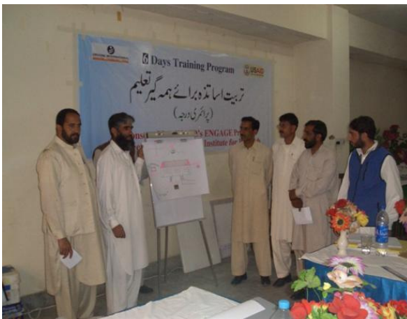
Photograph 2: Group Presentation at a Workshop