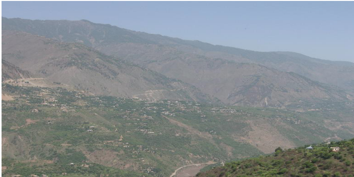
Photograph 1: Area Near Bagh, Showing the High Elevation and Difficult Terrain

In the District of Bagh, 123 primary schools serve children in Grades 1–5. Many of the schools are still operating from the temporary structures that were erected after the October 2005 earthquake. The project worked with 25 teachers (14 males and 11 females). The District of Bagh did not operate any special schools for children with disabilities. If a child with a disability were to attend school, then he/she would be in one of the primary schools, unless the child resided at one of the special schools located in Islamabad (the capital of Pakistan) or Muzaffarabad (the capital of the state of Azad Jammu and Kashmir). Few children with disabilities were enrolled in primary schools, and most were not in any school. In addition, community rehabilitation services were not available to people with disabilities. For these reasons, a pilot-inclusive education project was needed and supported by education officials in the District of Bagh.