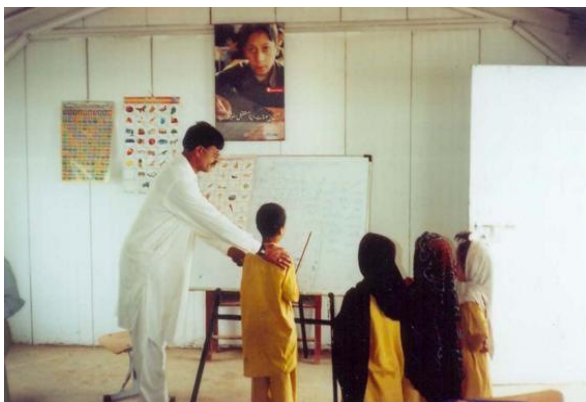
Photograph 4: Teacher With a Group of Children