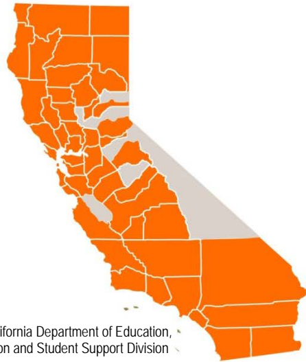
Data from California Department of Education, Early Education and Student Support Division